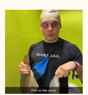
Mens Rugby brought real fish into the union - they thought it was so funny

"Singlehandedly revolutionised the SNIMS instagram scene" - Milfy Medics FC