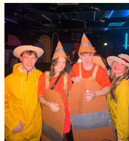
Medic Hockey declined to comment but I took this picture from their instagram